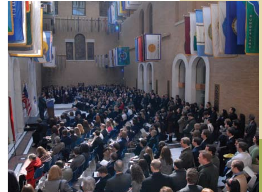
On February 28, 2008, nearly 600 attorneys from across the Commonwealth convened at the State House for the 9th Annual Walk to the Hill for Civil Legal Aid.