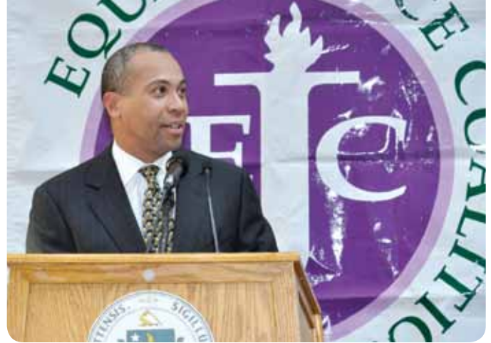
Nearly 700 attorneys gathered at the State House for the 11th Annual Walk to the Hill for Civil Legal Aid on January 28, 2010. Governor Deval Patrick made a surprise appearance to announce his support for level funding of the MLAC line item in FY11.